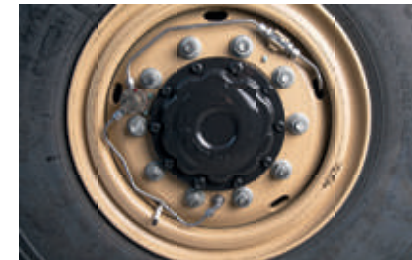
Central tyre inflation system