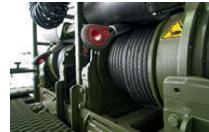
Double winch system