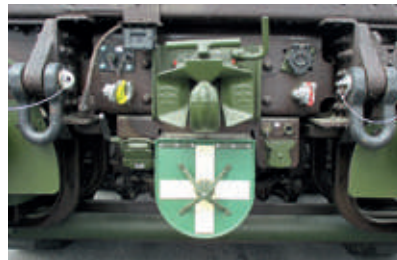
Military trailer coupling