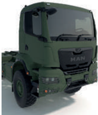
HIGH ROOF SLEEPER CAB