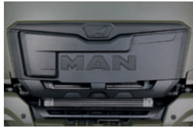
Cyclone / Air filter