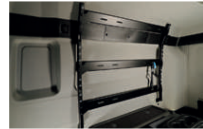
Preparation for weapon holder