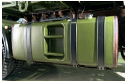
Militarised fuel tank