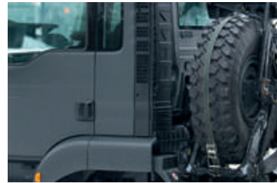
Spare wheel holder