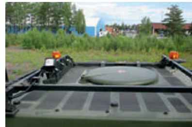
Swivel type roof hatch